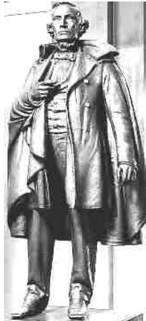
Statue of Jefferson Davis

From 1878-1881, Davis wrote The Rise and Fall of the Confederate Government . He finished A Short History of the Confederate States of America in October 1889. Two months later, on December 6, Davis died of unknown cause at the age of eighty-one.